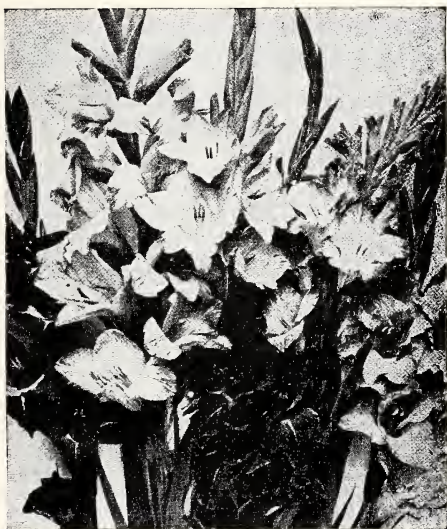
A Bouquet of Gladioli

Annie Wigman. Pale yellow, with a small dark blotch in the throat, very attractive. 15 cents each, $1.50 Dozen.